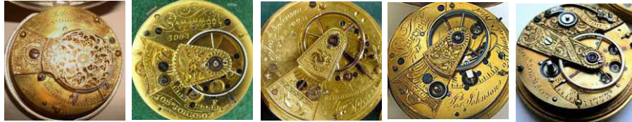
A Full-width pierced table (sometimes called 'thistle cock') B Double wedge, cutaway foot C Double wedge, full-length foot D Single wedge, cutaway foot E Parallel-sided