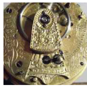
Relief Design is three-dimensional

5 In the Movement Inscription column, the typefaces used have been chosen to give an idea of the actual styles of lettering. These can be no more than approximations and (for example) do not indicate where the lettering has been engraved in a curve rather than a straight line. When the name Liverpool is engraved in 'Old English' script ( Liverpool ), it is usually surrounded by calligraphic flourishes; these cannot be reproduced, but they may be assumed to be present except where stated.