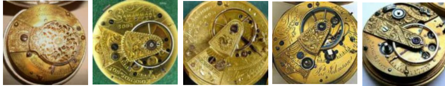
A Full-width pierced table (sometimes called 'thistle cock') B Double wedge, cutaway foot C Double wedge, full-length foot D Single wedge, cutaway foot E Parallel-sided